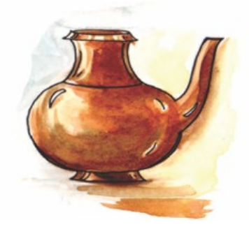
Jug : collect and for pouring water