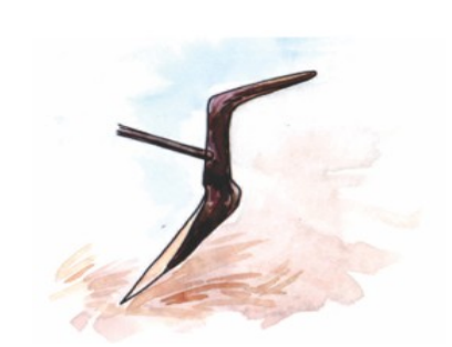
Plow : For ploughing